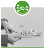
Information Management & BIM Levels 2, 3 & 4

We provide information management strategies, plans and project delivery for BIM Levels 2, 3 and 4 and specialist data analytics services, a niche area where the UK has taken a leading role in driving 20% savings in public sector costs.