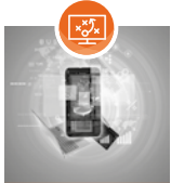
Business Systems Design and Delivery

We offer the design and delivery of new business systems to suit the needs of major client and design and construction businesses with a clear focus on driving business improvement, productivity, value and cost savings.