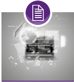
Documentation and IMS

We can design and produce large and complex integrated systems documentation, including Integrated Management Systems for client businesses and major construction projects.