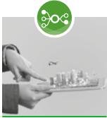
Information Management & BIM Levels 2, 3 & 4

We provide information management strategies, plans and project delivery for BIM Levels 2, 3 and 4 and specialist data analytics services, a niche area where the UK has taken a leading role in driving 20% savings in public sector costs.