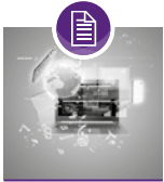
Documentation and IMS

We can design and produce large and complex integrated systems documentation, including Integrated Management Systems for client businesses and major construction projects.